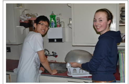
New Friends at Community Dinner

At the end of November, we had an “Evening of Koinonia,” bringing together a number of students to share communion and to ask the questions of who makes up our community, what do we care about and how is God using each of us to be a light to the world? It was a beautiful evening. For many, it was the first time they had met a lot of other people in the