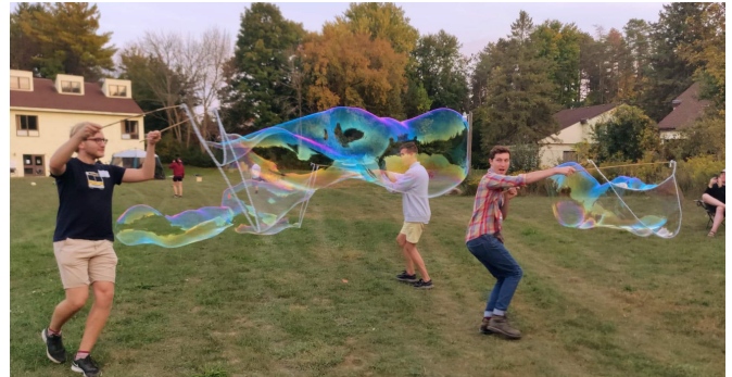
GCM's Outdoor and Distanced Fall Retreat

However, Covid-19 has impacted the social side of my university experience more than it has impacted the academic side. This social isolation has been very challenging for me and many other students. Guelph Campus Ministry (GCM) has been working to help keep me and many other students connected, giving us a sense of belonging and Christian community. On a Saturday in September, GCM co-hosted an outdoor, physically- distanced fall retreat on the beautiful grounds of Creiff Hills Conference Centre, where over 25 students were able to connect safely in-person for a time of socializing, hikes, and spiritual growth. This event had a big impact on me as I was able to actually meet and get to know new people, which has been next to impossible in my online-only classes.