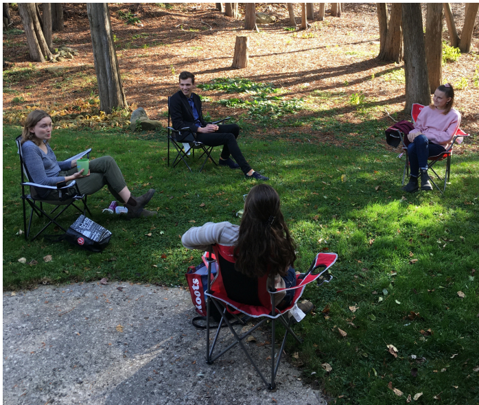
GCM's Outdoor and Distanced Drop In

We have been reminded that God's faithfulness and love are reliable in the midst of so much uncertainty in our daily pandemic-affected lives. As we enter Advent and remember the Incarnation – that God became human and lived among us, in the midst of our humanity and hurt – may we embrace this paradox: in these times of disorientation we need opportunities both to lament what is lost and to remind each other of the (Biblical and personal) stories of God's faithfulness to us. I regularly mourn all of the "normal" events and connections that we have lost this semester. And, I continue to marvel at the ways God has been steadfastly loving GCM, through tangible acts of presence and care from our staff, students, and supporters. Great is God's faithfulness!